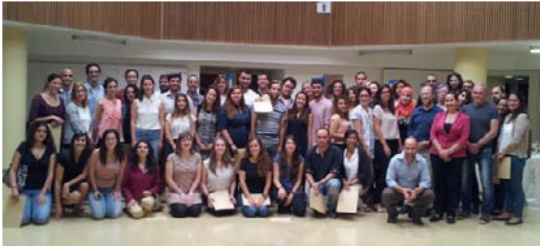
A group photo. The end of the year posters presentation event: 08.06.2014