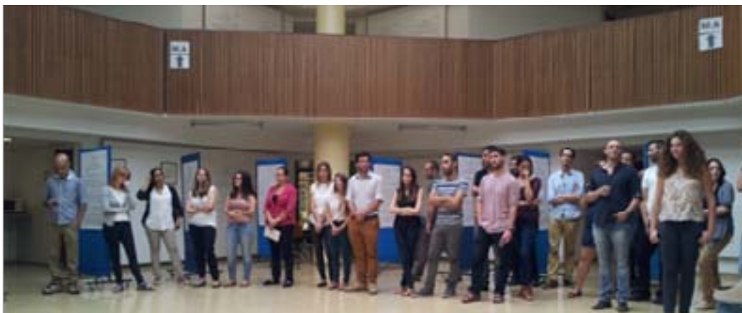
The internship program end of the year posters presentation event: 08.06.2014